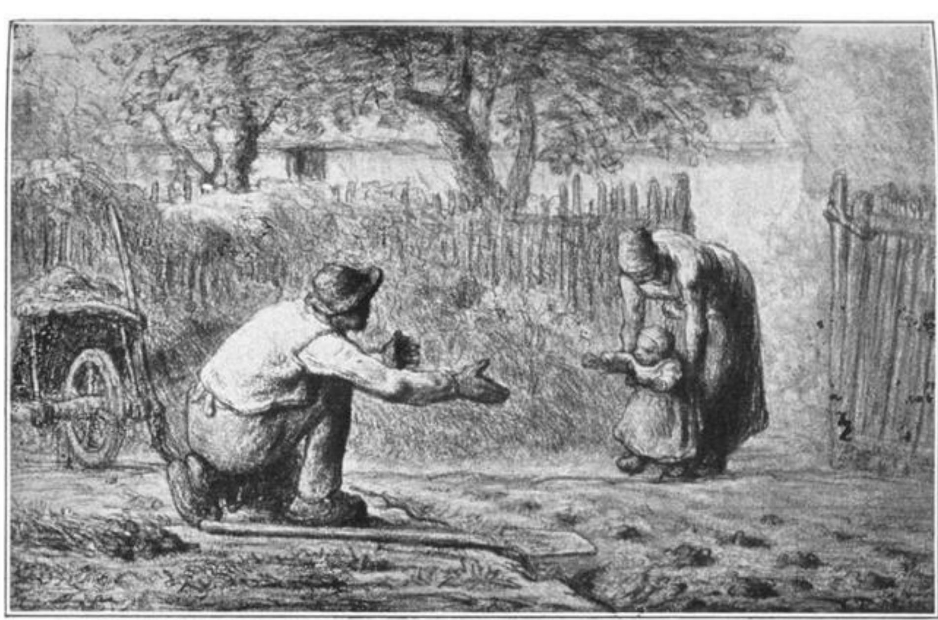
Plate 8.—Millet. "The First Steps."